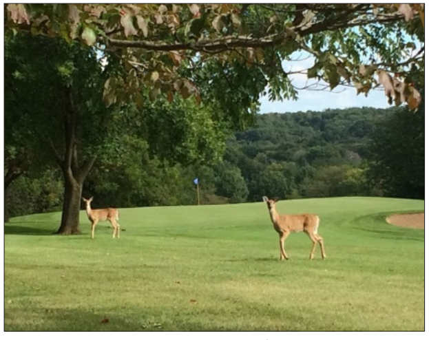
Figure 5. Deer are common golf course residents.