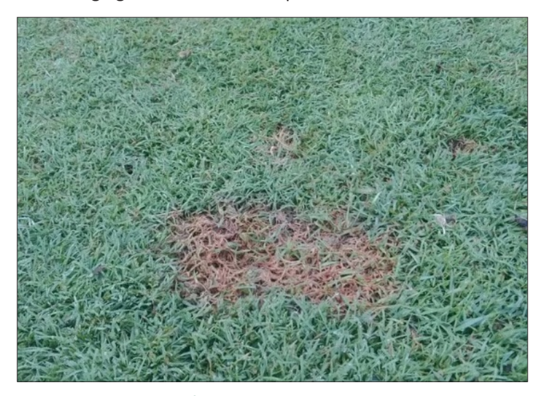
Figure 38. Pictures of a disease can help with a quick diagnosis.

• Record and map disease outbreaks and identify trends that can help guide future treatments and focus on changing conditions in susceptible areas to reduce disease outbreaks.