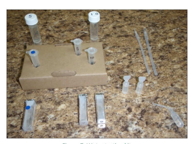
Figure 7. Water testing kit. Photo: