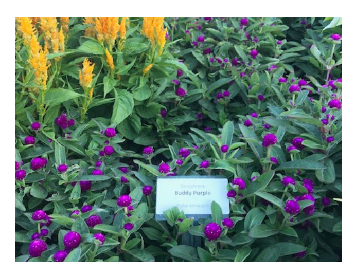
Figure 34. Label the flowers for great conversation on the course.