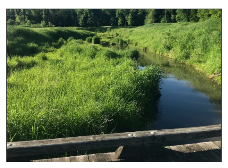
Figure 20. Buffer areas between the course and water source.