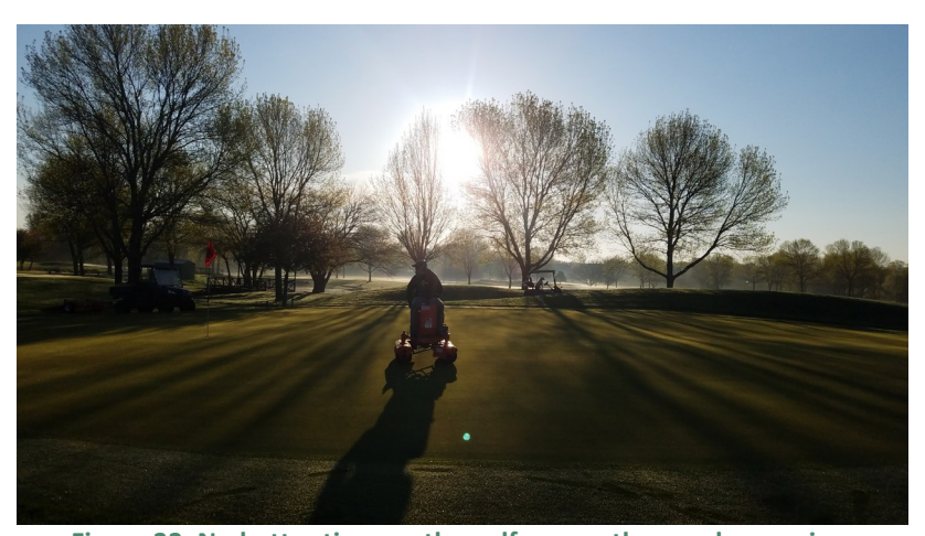
Figure 33. No better time on the golf course than early morning.