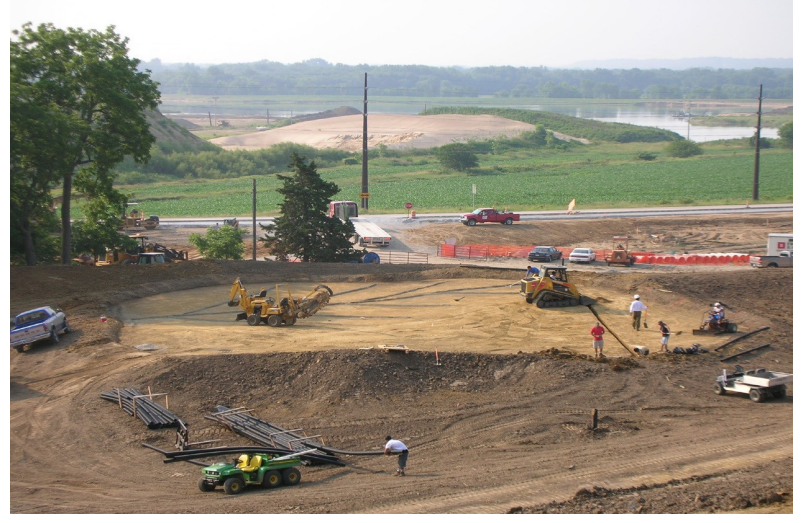
Figure 32. Golf Course Construction is an effort by everyone.