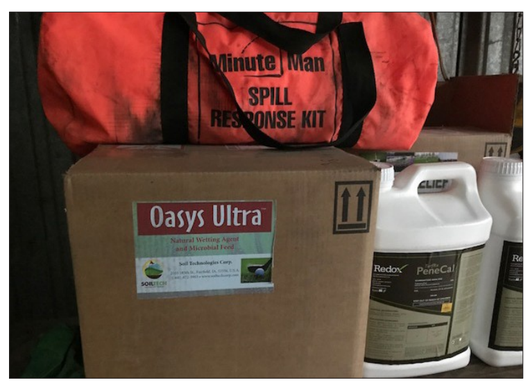
Figure 41. Have your spill response kit handy at all times.