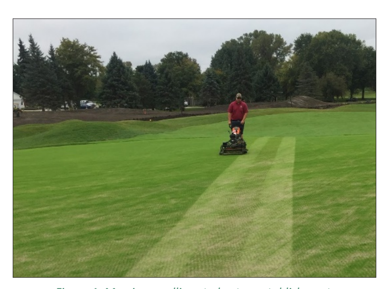
Figure 1. Mowing seedlings to hasten establishment.