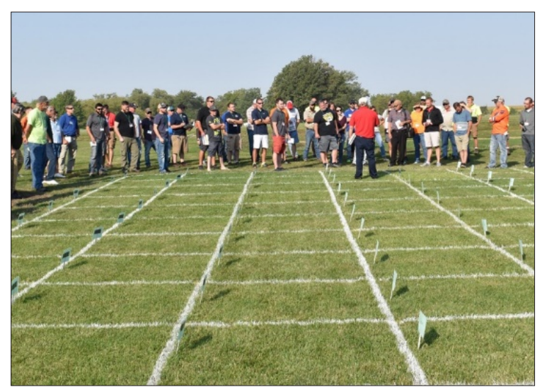
Figure 36. NTEP trials can show you what can work best for you.