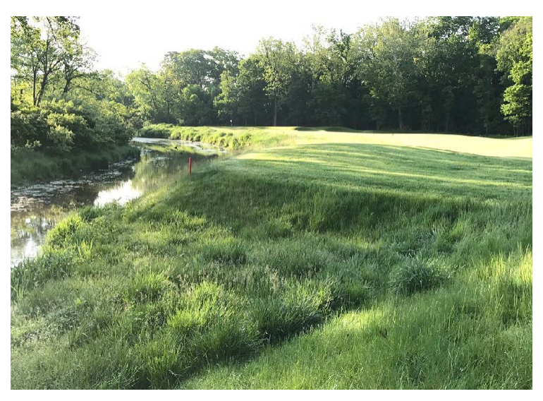
Figure 22. Buffer strip between maintained area and water source.