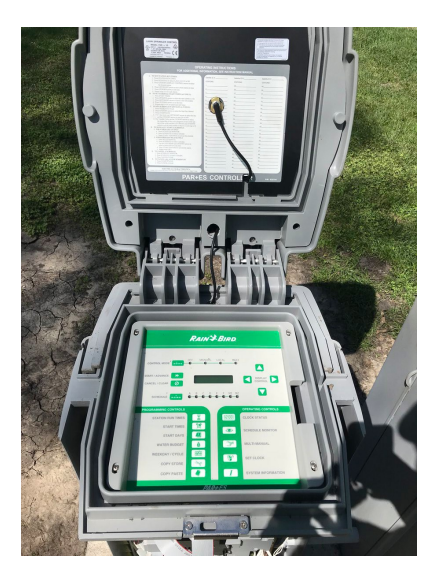
Figure 8. Updated irrigation controls can improve efficiency.