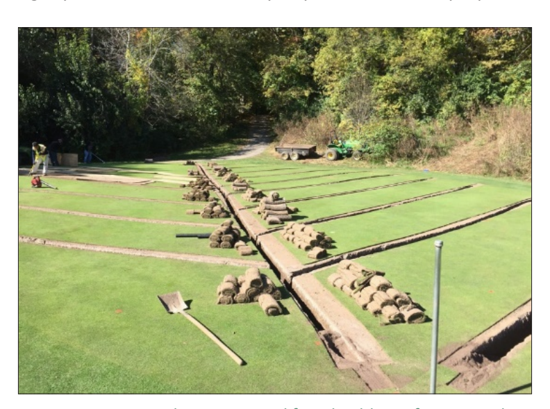
Figure 3. Proper drainage is vital for a healthy turfgrass stand.