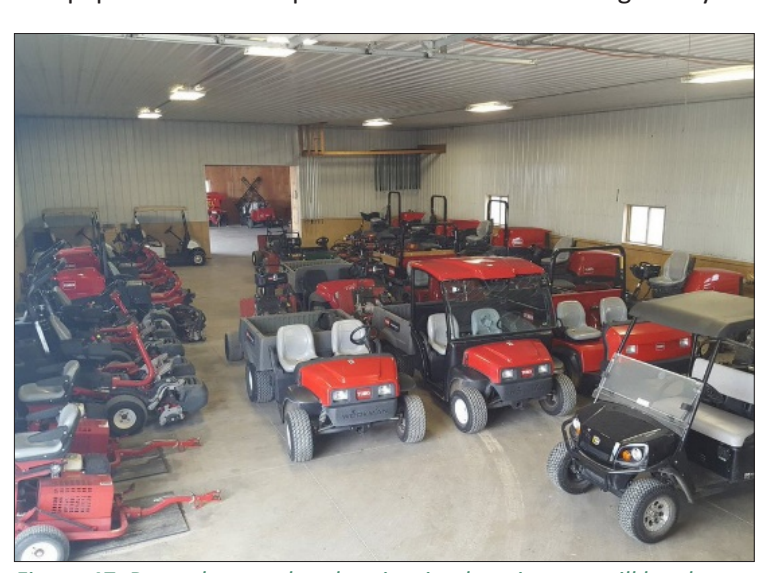
Figure 47. Properly stored and maintained equipment will last longer