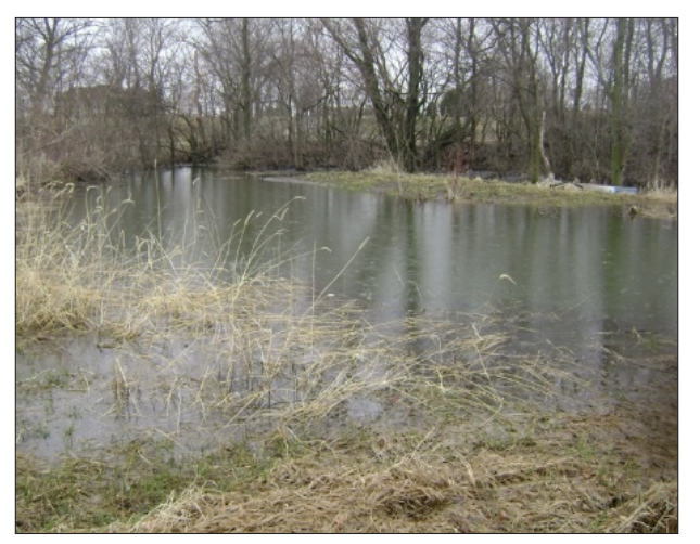
Figure 18. Full Silt Retention Pond