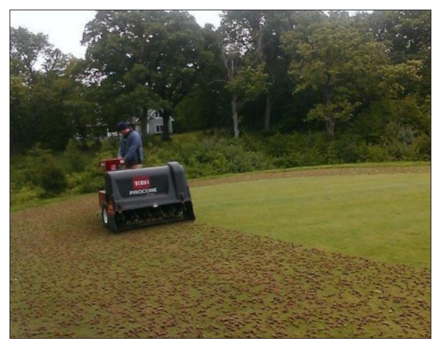
Figure 27. One of many core aerifications throughout the year.