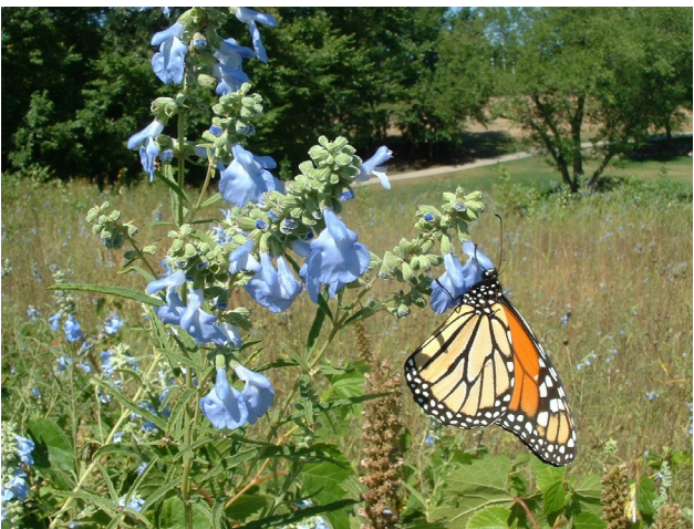
Figure 45. Monarchs love the golf course habitat.