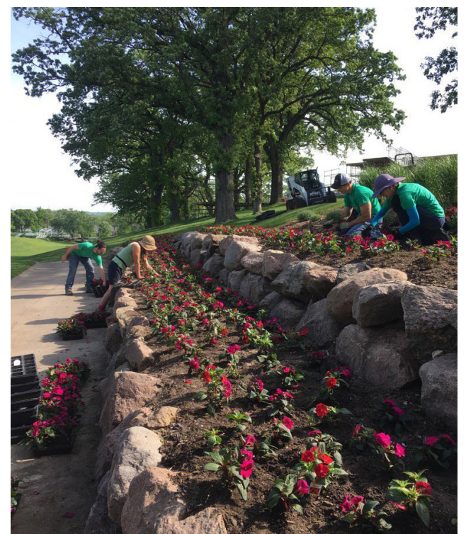
Figure 50. Landscapes add additional aesthetics to the property.