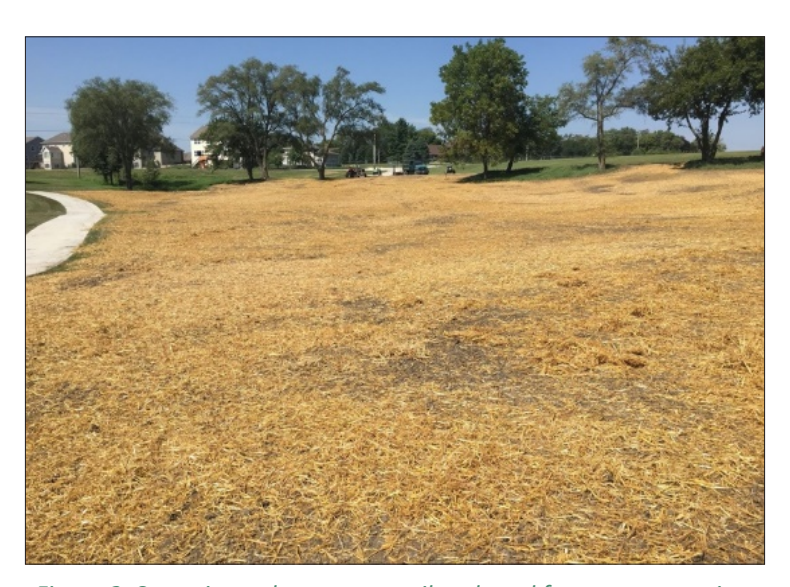
Figure 2. Straw is used to protect soil and seed from water erosion.