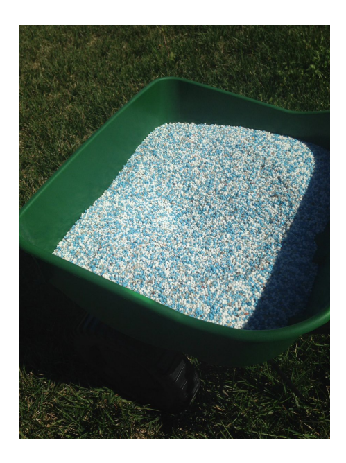
Figure 25: Fertilizer is ready to be applied