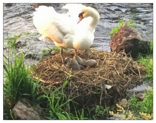
Figure 4. Mute Swan hen with cygnet and eggs.