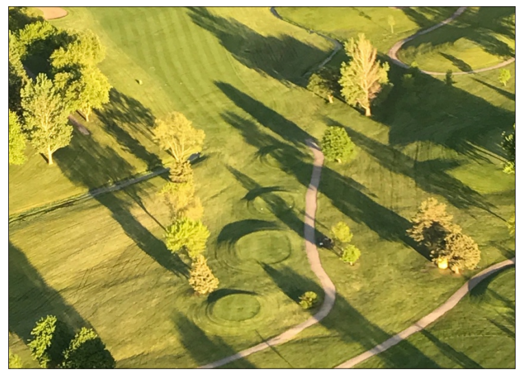
Figure 16. Having a good look at the surface overview is beneficial