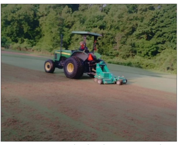
Figure 28. Removing thatch and promoting growth on the fairways.