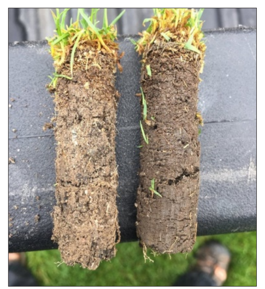
Figure 24. Sample plugs for soil testing.