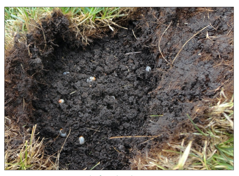
Figure 35. Grubs found in the scouting process.