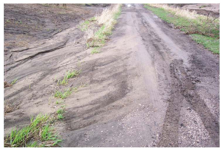
Figure 15. Silt from neighboring development, over the cart path.