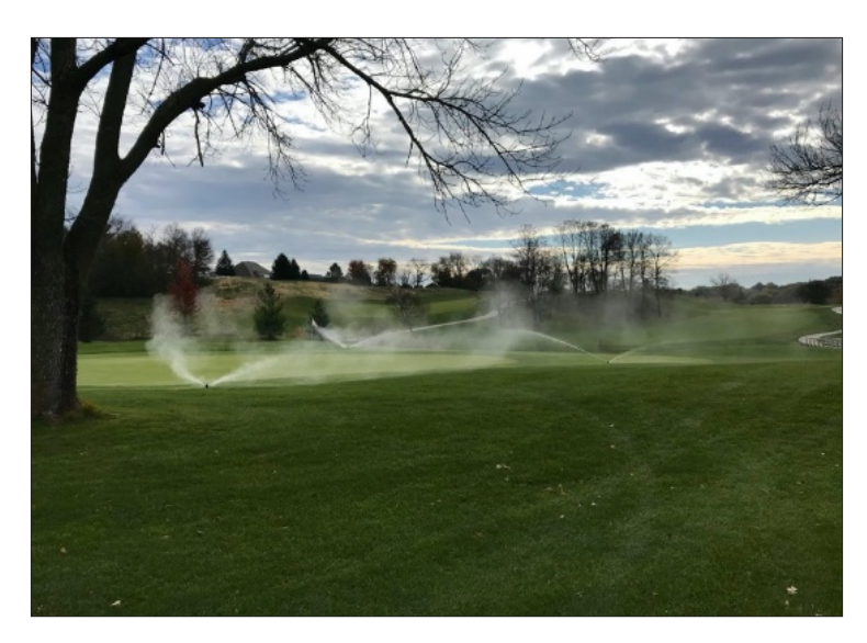
Figure 13. Get as much of the water out of the pipes as possible.