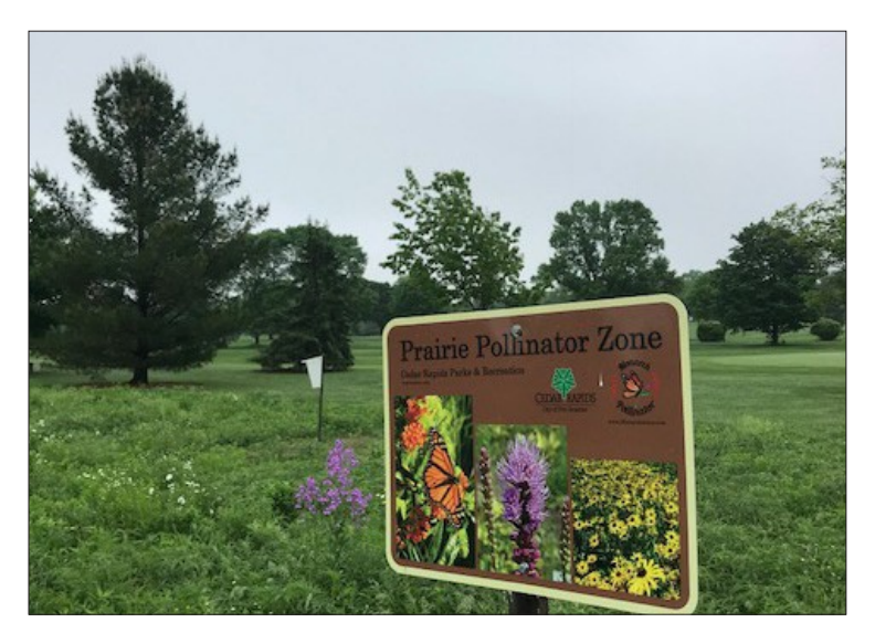
Figure 39. Not all weeds are bad.