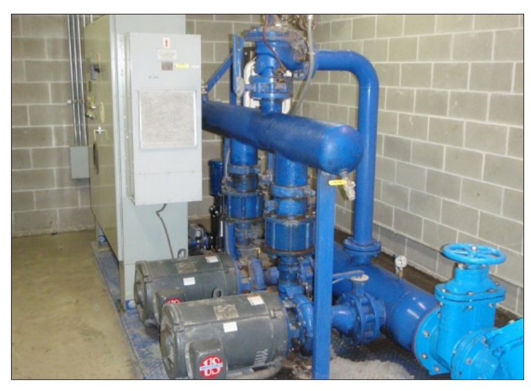
Figure 7. Pump station at Wakonda Club.