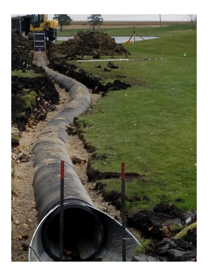
Figure 17. Drainage pipe installation.