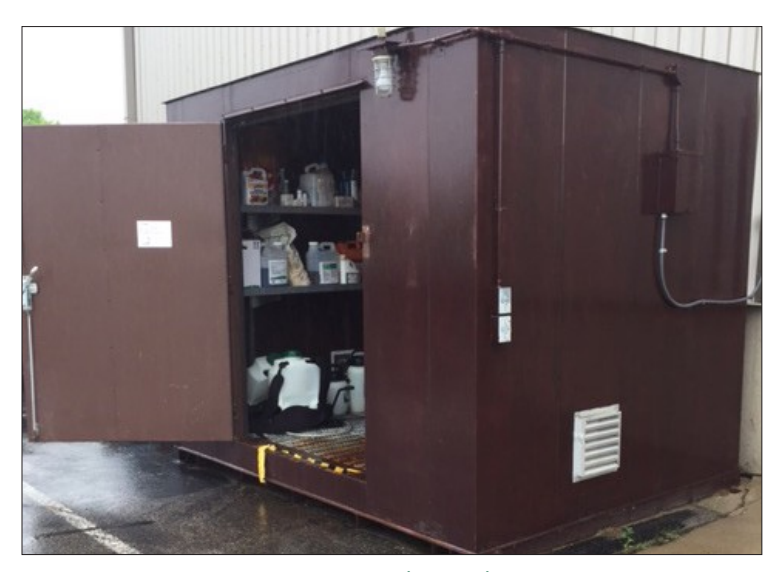
Figure 46. Proper chemical storage.