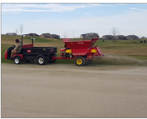
Figure 30. Topdressing to aid in recovery and smooth the surface.