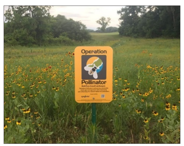
Figure 44. Operation Pollinator.