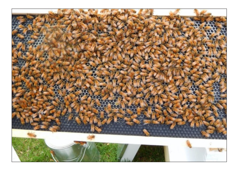
Figure 37. Bees can thrive on a golf course.