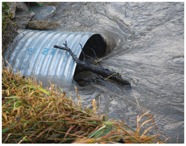
Figure 19. Having the right sized pipe is extremely important.