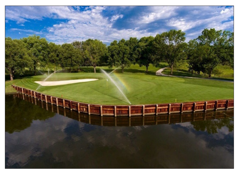
Figure 6. Proper irrigation systems improve water use efficiency.