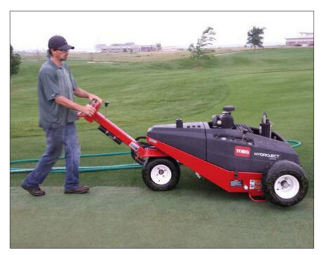
Figure 29. Getting water directly to the roots with a hydroject machine.