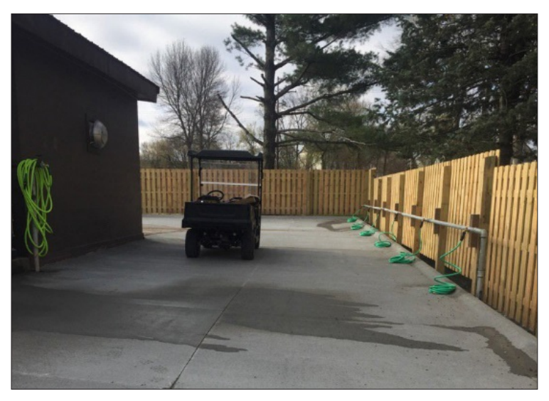
Figure 48. Designated wash area.