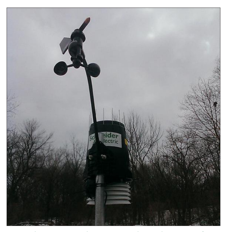
Figure 14. Weather Stations can be your eyes and ears when you aren't around.