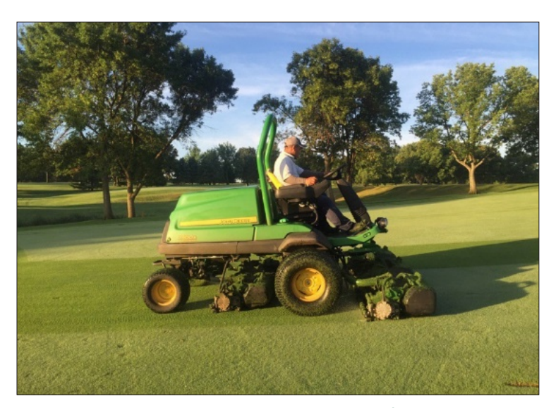
Figure 26. Collecting clippings on the fairways