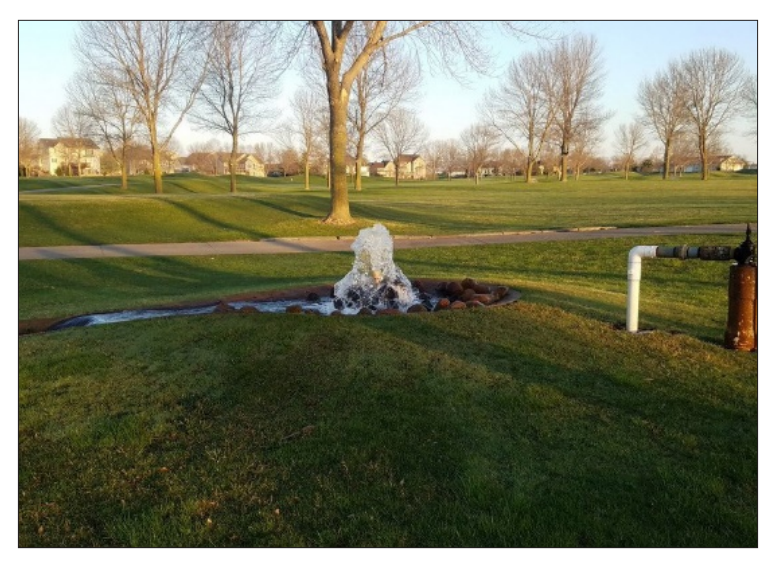
Figure 10. Well location at Briarwood Golf Club.