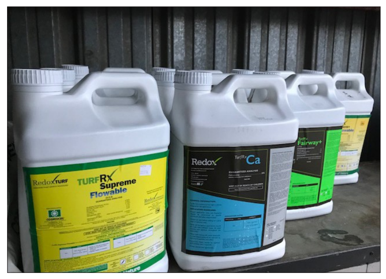
Figure 40. Keeping stored chemicals off the ground is important.