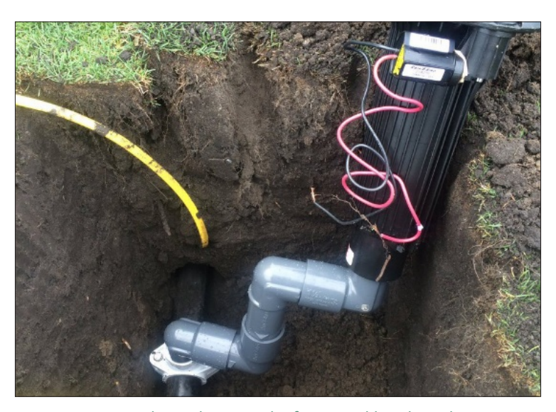
Figure 12. Always keep track of pipe and head conditions.