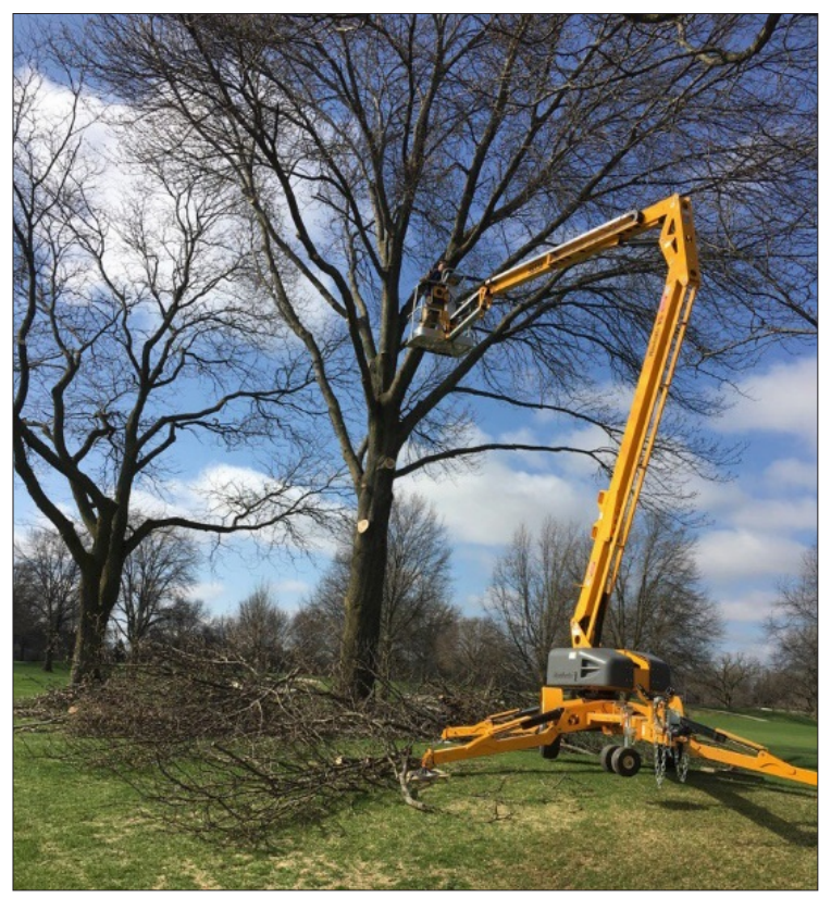
Figure 31. Fall tree trimming for more sunlight in the spring.