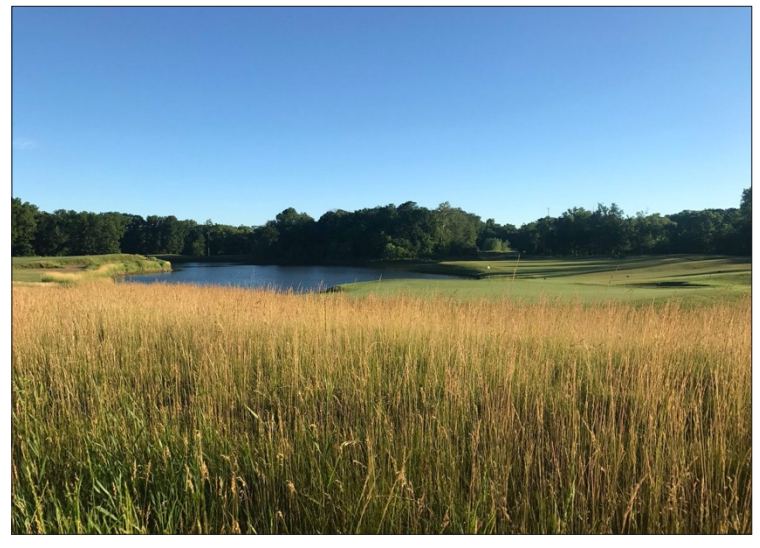
Figure 49. Overlooking one of many no-mow areas.