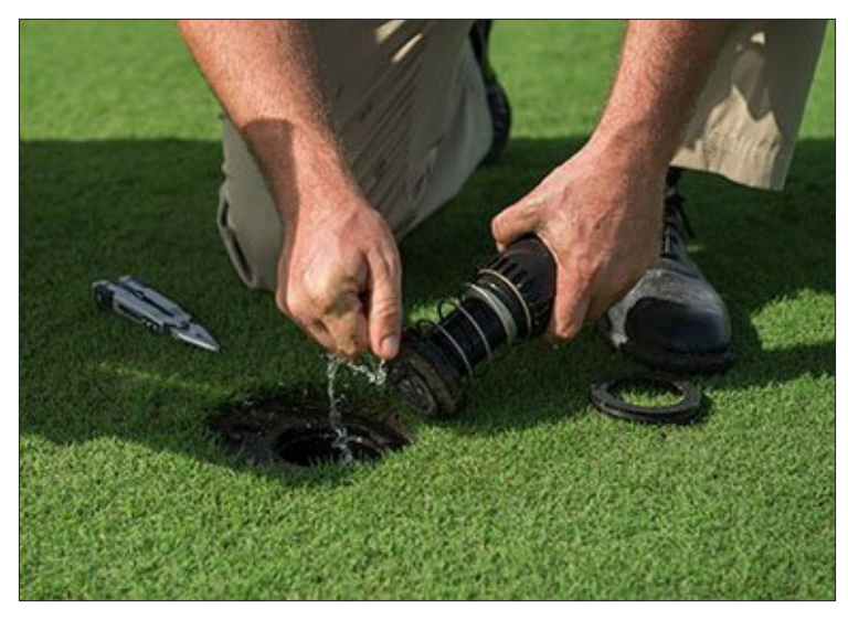
Figure 11. Make sure to check everything.