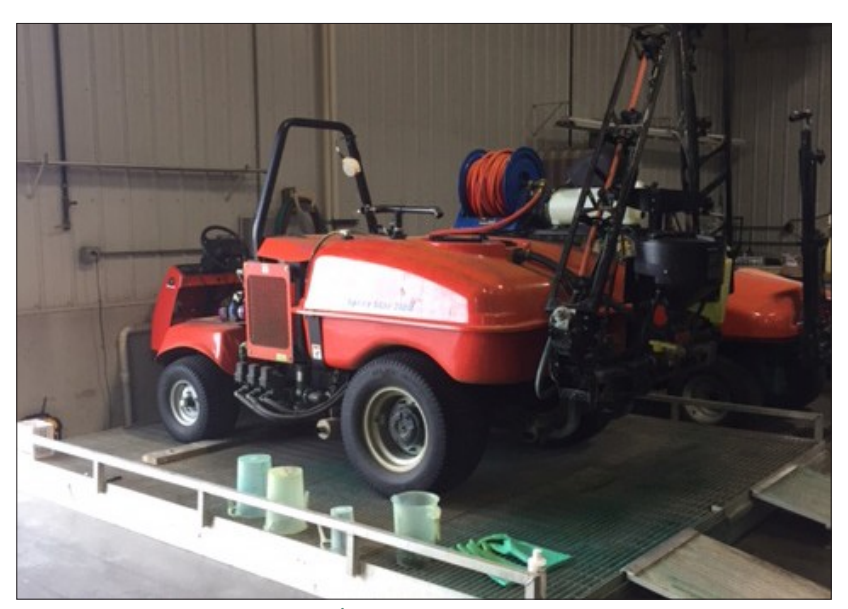
Figure 42. Designate a mix/load station to contain potential problems.