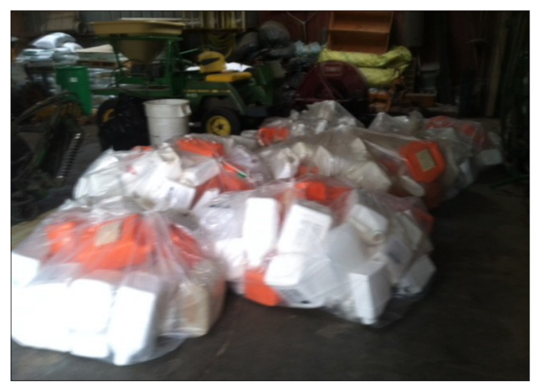
Figure 43. Proper recycling of used containers.