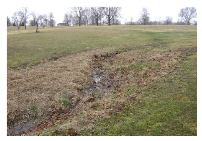
Figure 23. Water will make its own path in a storm.