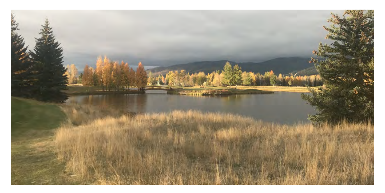
Teton Pines Golf Course - Jackson Hole, WY