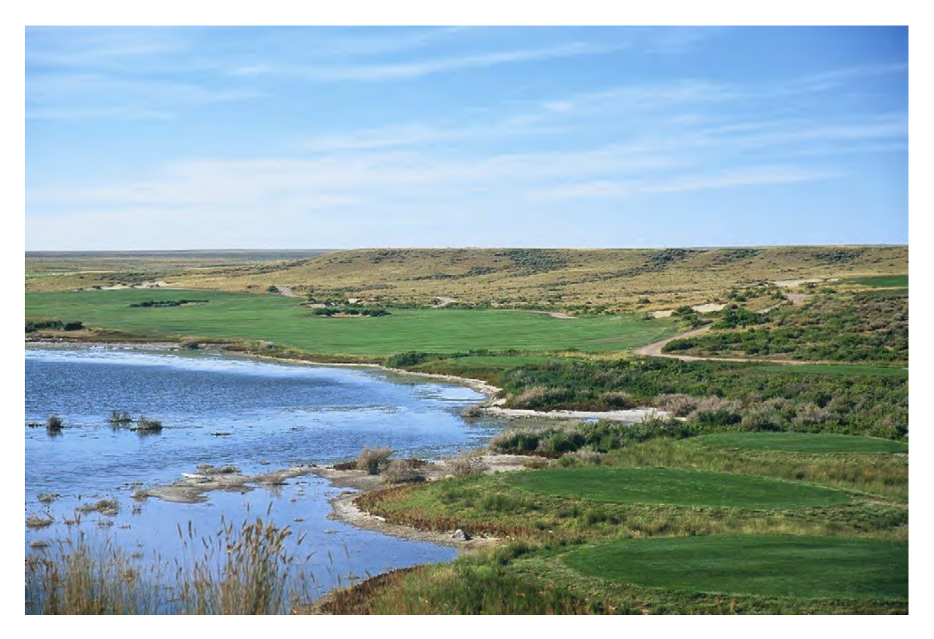
Rochelle Ranch Golf Course - Rawlins, WY