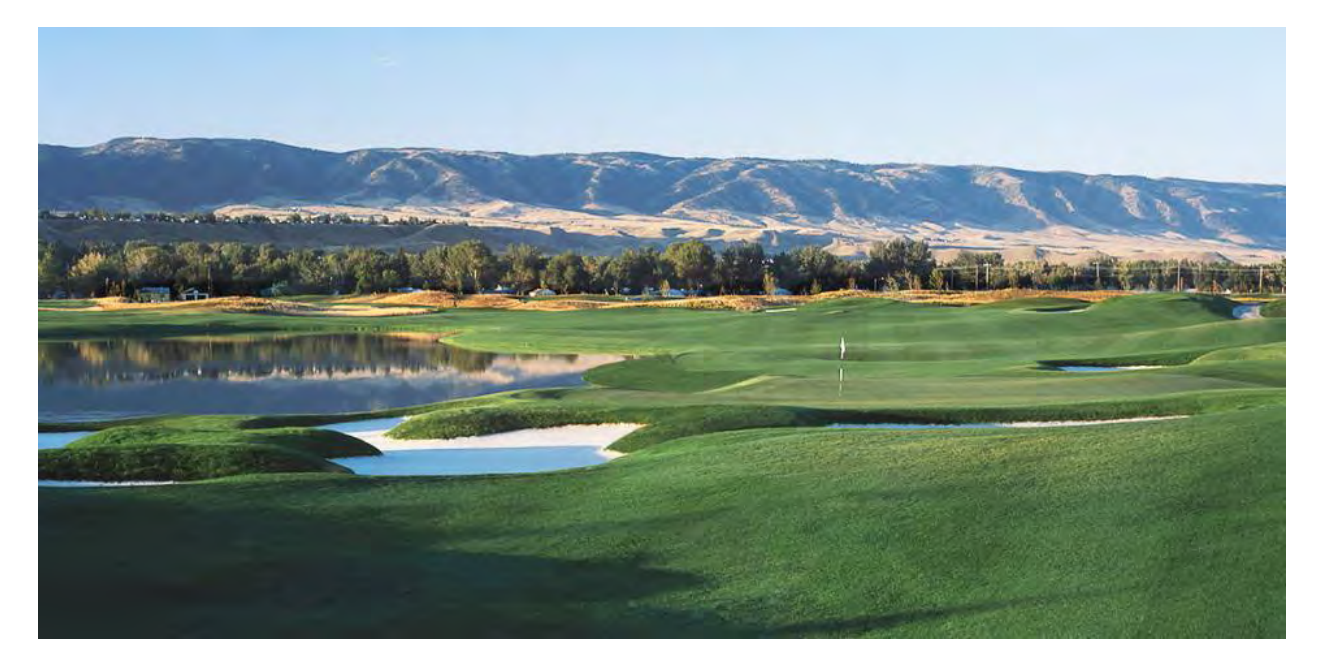
Three Crowns Golf Club - Casper, WY