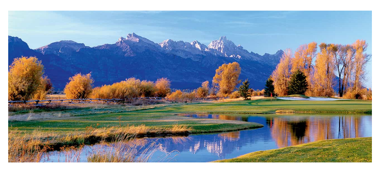
Jackson Hole Golf and Tennis Club - Jackson, WY